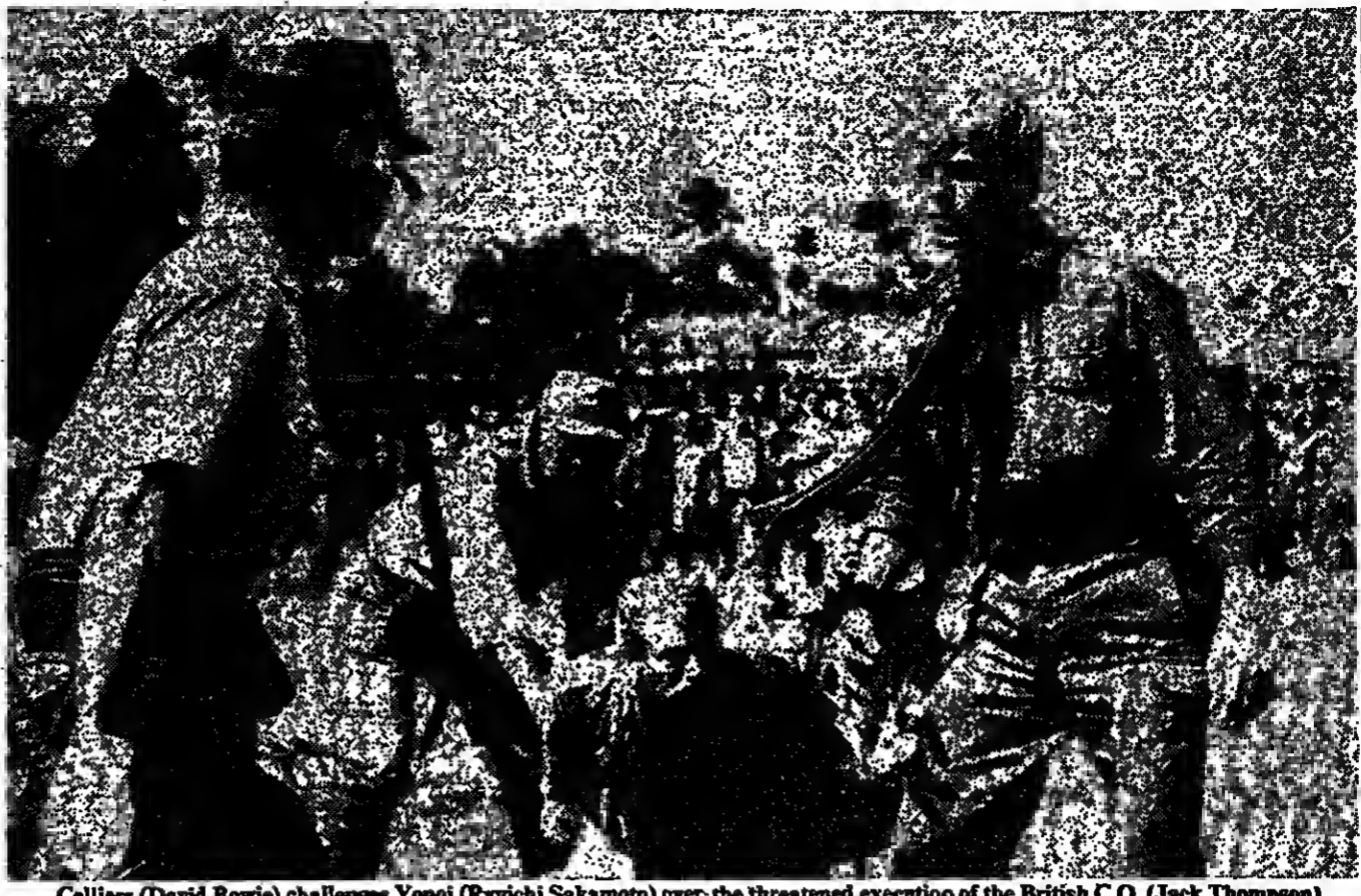
Celliers (David Bowie) challenges Yonoi (Ryuichi Sakamoto) over the threatened execution of the British C.O. (Jack Thompson)